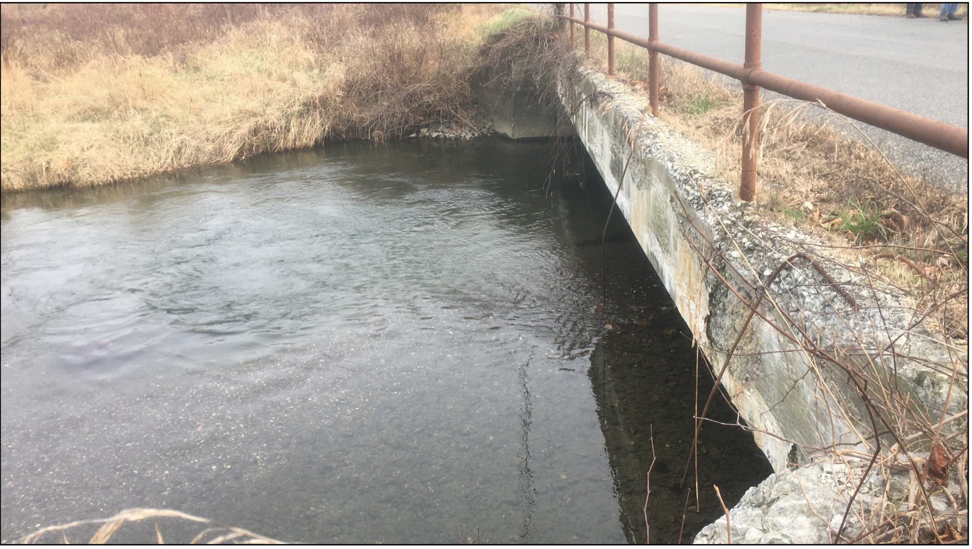
3. Twin Bridges Road water connection