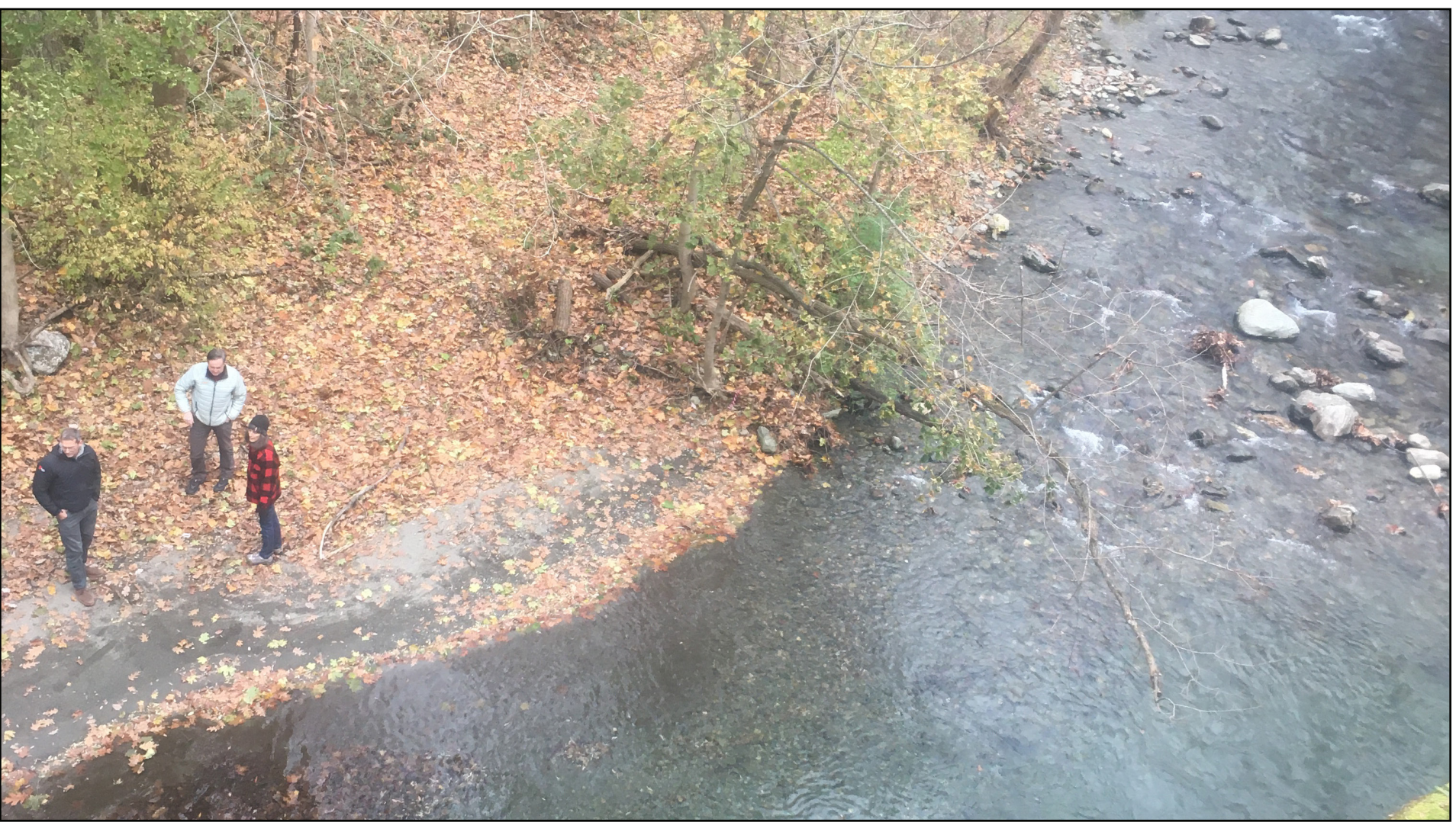
4. Overlook & path to creek