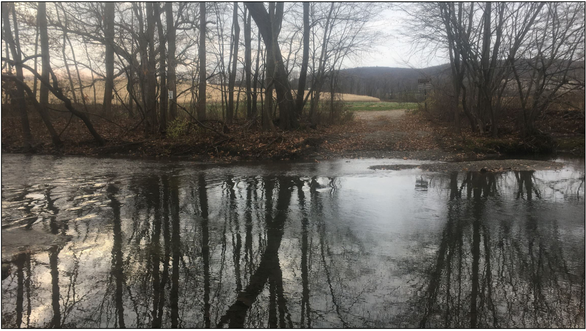
2. Potential future trail connection (Route 22 south of Library)