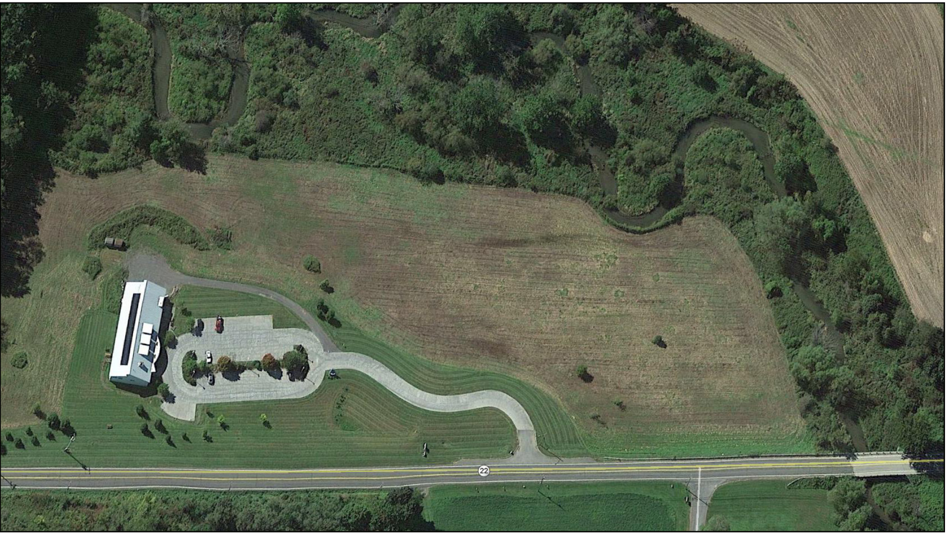
1. Roeliff Jansen Community Library